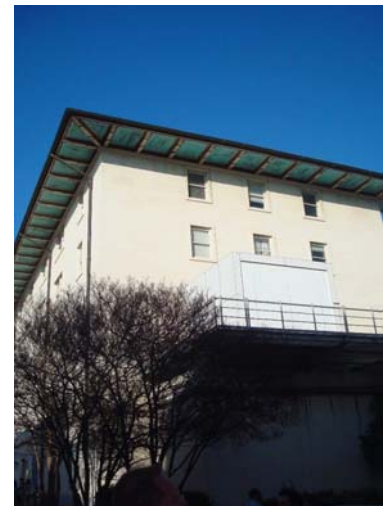
Sustainable Materials lab addition