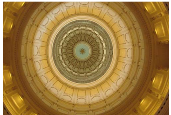
State of Texas Capitol Dome