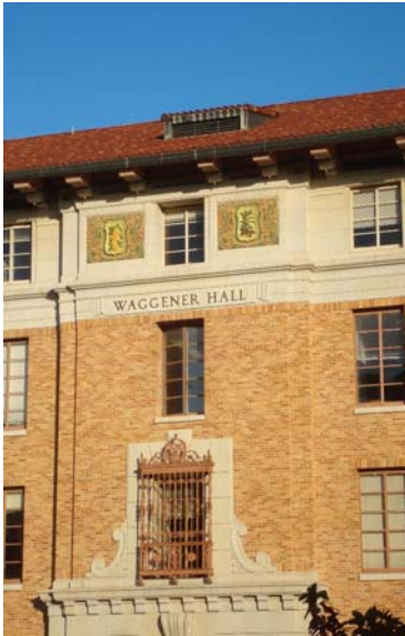
Historic Waggener Hall

confidence in the decisions related to the project, and