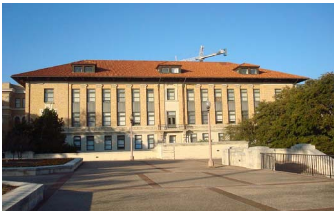
Historic Campus with construction crane