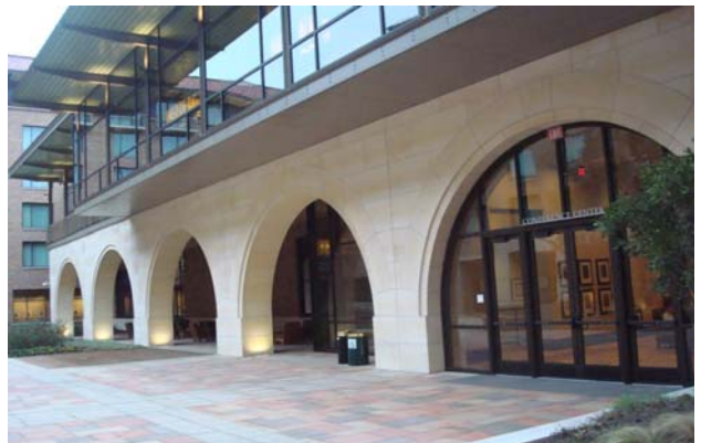
New AT&T Center

Nader offered a draft resolution for discussion and consideration. A motion to approve the resolution will be tabled until tomorrow's session.