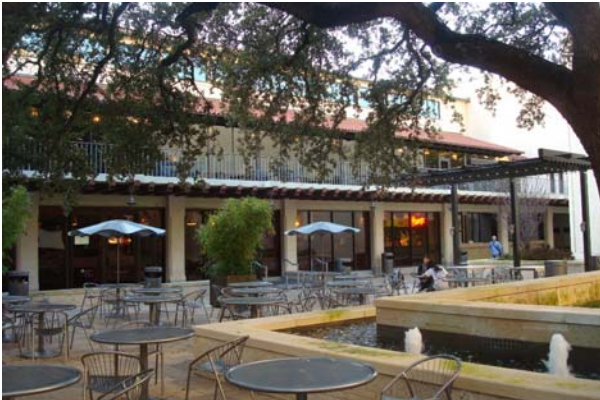
Student Union across from Architecture Building

Board appointee to the 2010 Nominating Committee